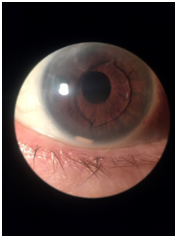
Figure 1. Biomicroscopy showing the anterior-chamber intraocular lens and a fragment of the corticosteroid implant located inferiorly.