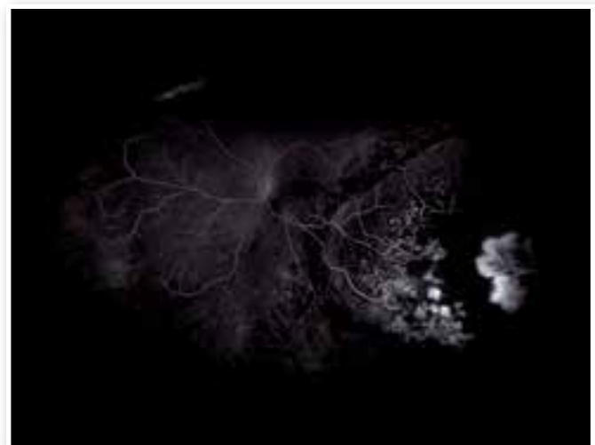
Figure 2. Late phase angiofluoresceinography scan showing neovessels in lesion topography with leakage.