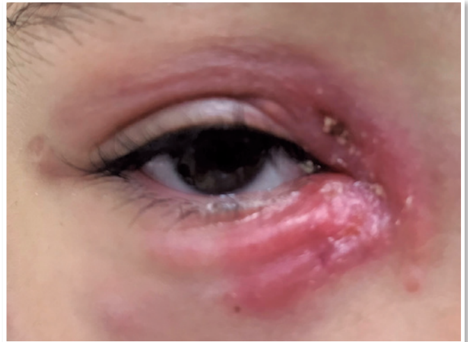
Figure 1. Pustular hyperemic lesions in the medial right upper and lower eyelid, next to the caruncle.

ted lesion 3 . The disseminated cutaneous form is rare, initially asymptomatic, more frequent among immunosuppressed individuals, of hematogenous dissemination, and may cause lung diseases, sinusitis, and meningitis 6,7 . Isolating Sporothrix in a culture from clinical specimens such as exudate, sputum, or lesion scraping is the gold standard for diagnosis. The “asteroid body” is a structure considered typical but not pathognomonic. Incubation in sheep blood agar can show the growth of colonies of “cigar-shaped bodies”, whereas Sabouraud dextrose agar can feature a “salt and pepper appearance,” highly suggestive of Sporothrix schenckii 2 .