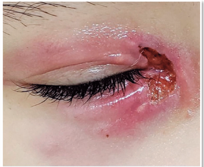
Figure 2. Deep ulcerated purulent lesion in the right caruncle.