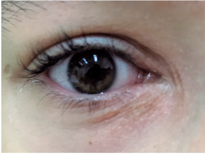
Figure 3. Complete remission of lesions after the end of treatment.

Histology can guide the diagnosis, but is not pathognomonic. Generally, an inflammatory reaction is observed, with suppurative granulomatous nodules, which may be confused with tuberculosis, other mycoses, and syphilis. Organisms are scarce and rarely detected in histopathology 2 . Thus, as observed in our case, the clinical aspect of the lesions and the epidemiological link became essential for adequate diagnosis and treatment, as biopsy results are negative in many cases.